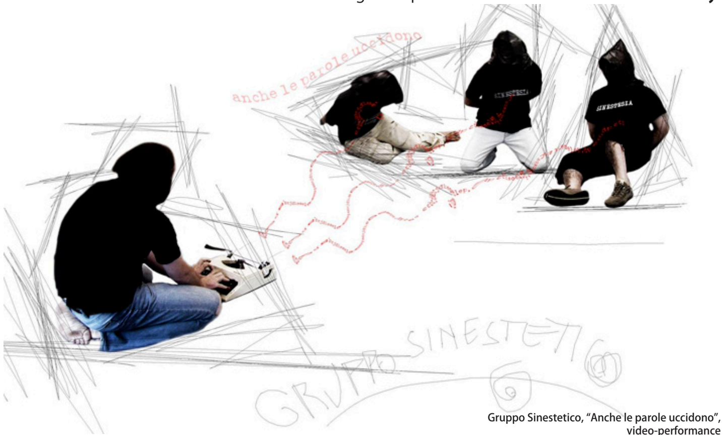
Gruppo Sinestetico, "Anche le parole uccidono", video-performance

The official opening of CATODICA will take place at 18.30 on January the 22nd at Stazione Rogers , with two exceptional events: a swift and explosive live performance by the Gruppo Sinestetico Anche le parole uccidono (Words can kill too) and an interactive sound and vision show, Visual-Sonic Enaction , with active participation of the audience, produced by Pietro Polotti and Maurizio Goina of the Music and New Technologies Department of Trieste Tartini Conservatory .